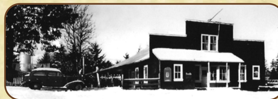
Photo: 1940s Madden's Store

Customers would hand their list to the clerk who would then collect the various goods off the shelves for them. In the late 1950s the store was redesigned for self-serve shelves. Today you can still see remnants of the original glass counters, flooring, shelving and skylights.